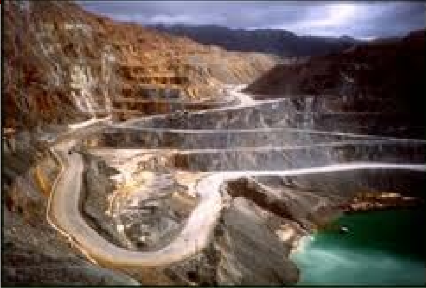
Marcopper mine on Marinduque Island