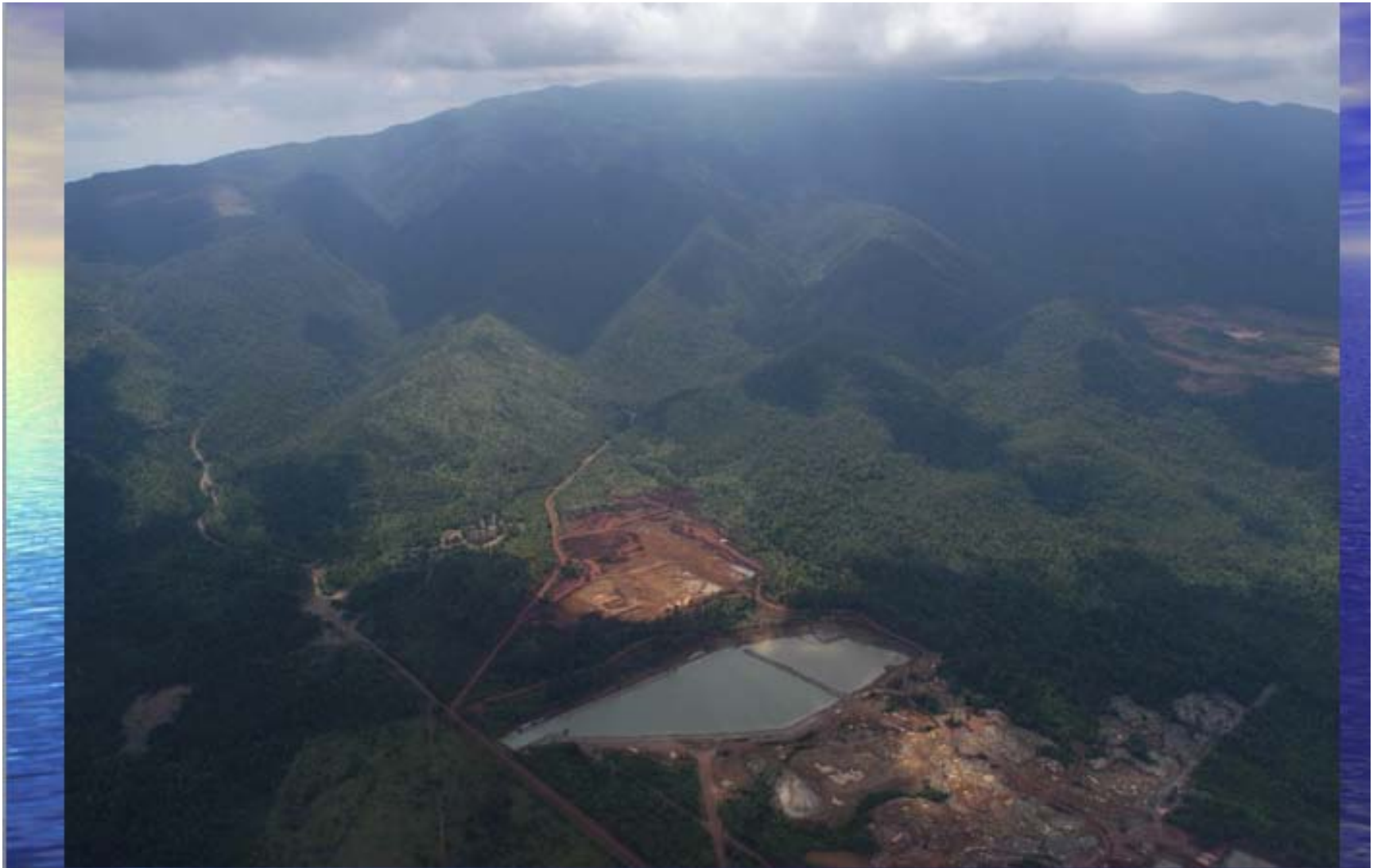
Photo (by Conservation International) showing mining operations the foot of Mt. Bulanjao Range. Expansion of mining activities are being pursued in the Bulanjao range which is still covered with old growth and second growth forests.